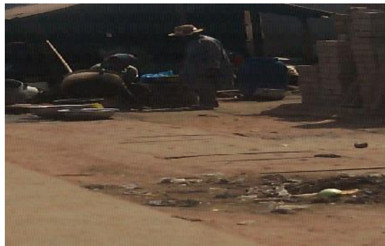
Figure 5: Street Restaurant near a Heap of Household Waste in Yaroua (Djougou). Shot: Assoumanou, March 2016.

Faced with the dangers incurred by the population in resorting to street food, consumers and vendors must become aware in order to avoid the worst, as everyone must feel concerned first and foremost about their own health. The Department of Hygiene and Basic Sanitation must work to train and retrain vendors in order to help them improve their practices and attitudes in terms of food hygiene, and to strengthen food safety and quality control. It should conduct long-term hygiene awareness campaigns for street food vendors and consumers.