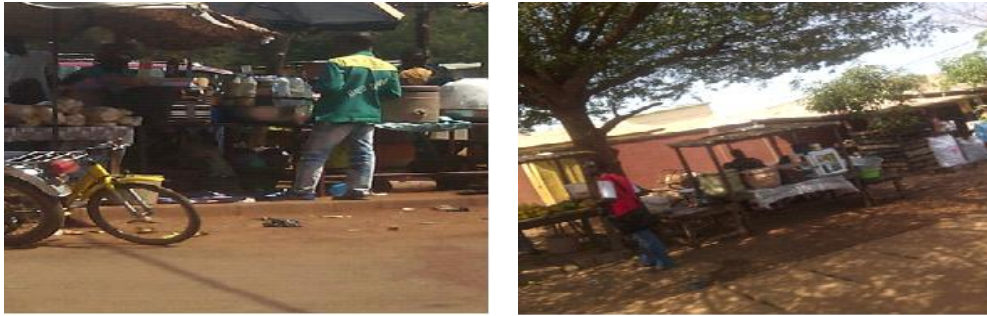
Figure 3: Street Restaurant Next to the LémameMandè Bus Station in Djougou 2.